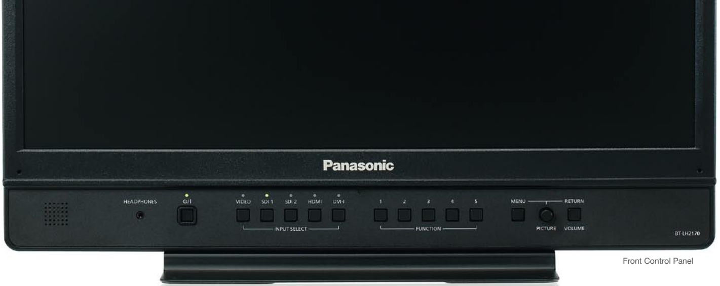
Front Control Panel