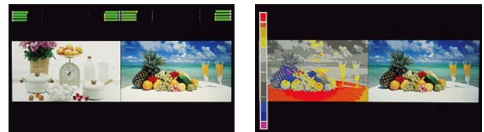
2-Input Motion Image Dual Window Display

Picture Assist (Image Adjustment): Image adjustment on the monitor and the results of assist functions from the same source can be displayed side-by-side with the original images for comparison.