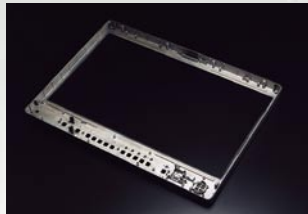
Aluminum Diecast Body