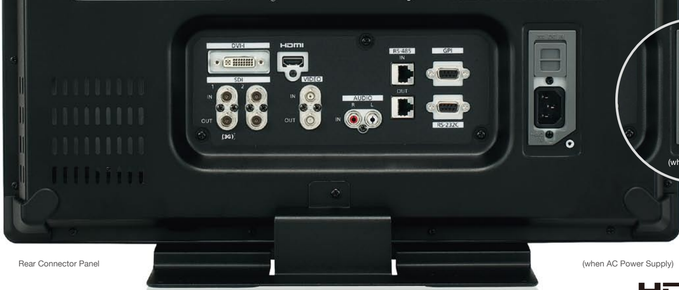
Rear Connector Panel